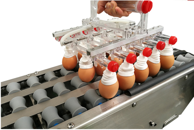
602 ZYS-ZK-30 Vacuum egg lifter